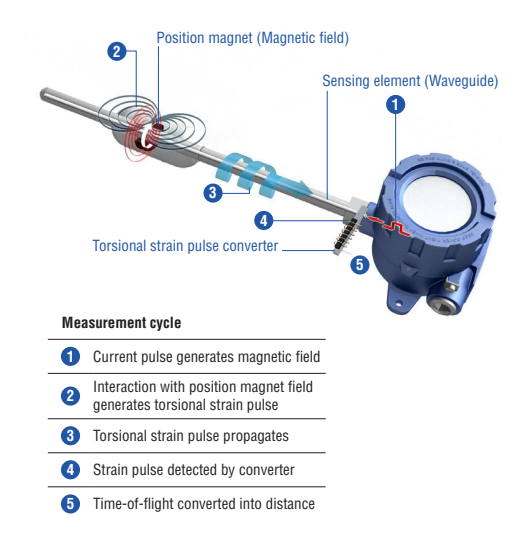
Fig. 1: Time-based magnetostrictive position sensing principle

Temposonics® Technology is the manner in which MTS applies the principles of magnetostriction to create a reliable position measurement system for use in industrial environments. Inside the sensor a torsional strain pulse is induced in a specially designed magnetostrictive waveguide by the momentary interaction of two magnetic fields. One field comes from a moving magnet, which passes along the outside of the transducer tube, and the other field is generated from a current pulse which is applied to the waveguide. The interaction between these two magnetic fields produces a strain pulse which travels at sonic speed along the sensor waveguide, until the pulse is detected at the head of the transducer. The position of the moving magnet is precisely determined by measuring the elapsed time between the application of the current pulse and the arrival of the strain pulse. As a result, MTS is able to create a reliable position measurement system that is capable of providing an accurate and repeatable measurement.